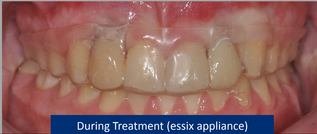
During Treatment (essix appliance)