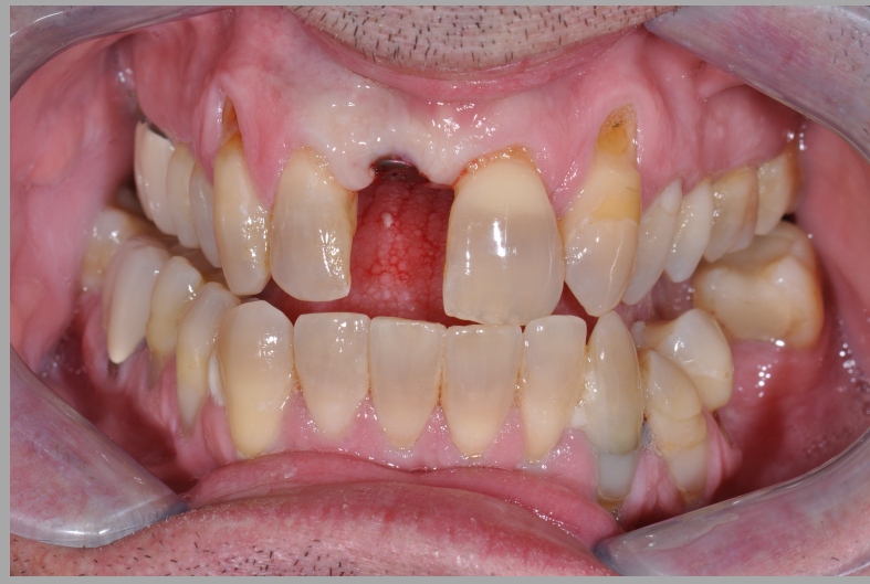
Patient is wearing an essix appliance during integration of implant #8