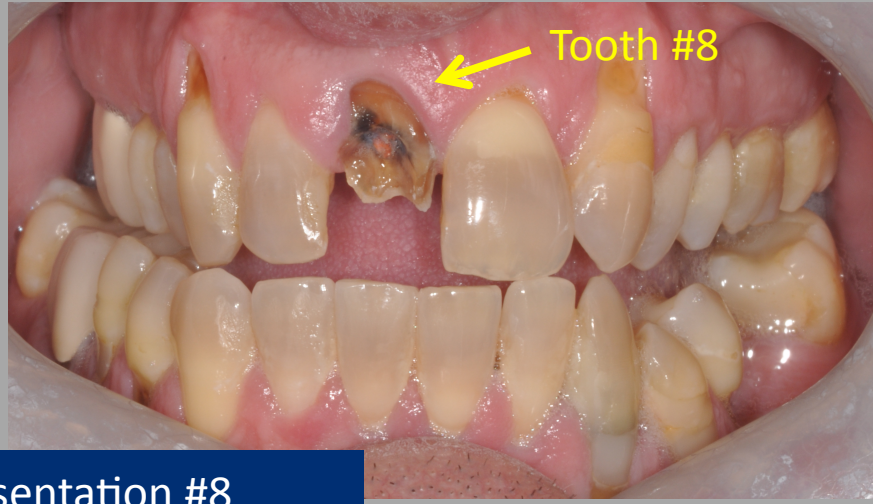
At Presentation #8