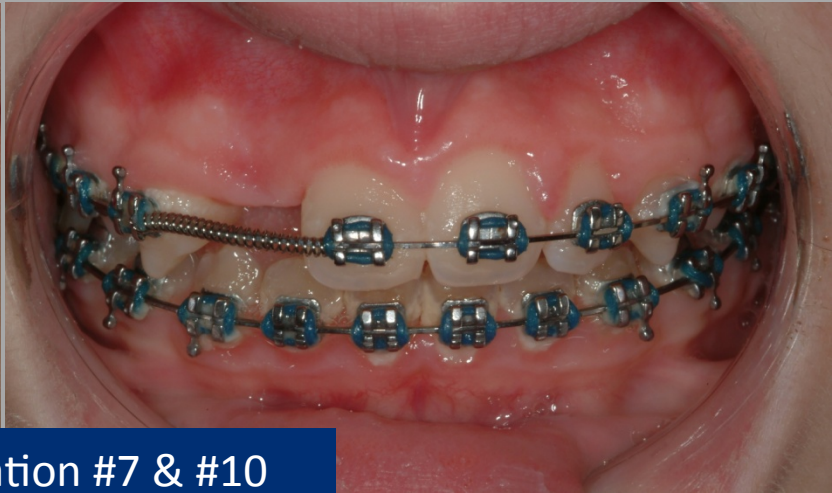
At Presentation #7 & #10