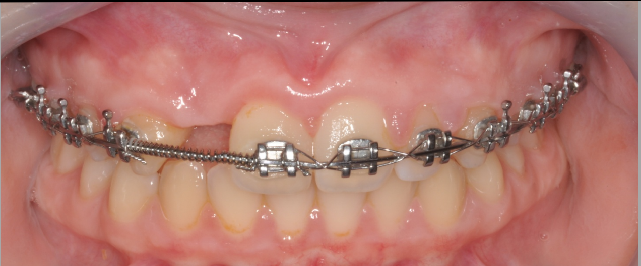
Implant Treatment was initiated while still in braces