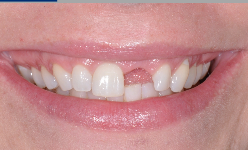
A flipper was used to temporarily replace #9 during implant integration