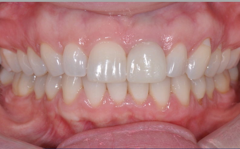
Final Implant Crown #9