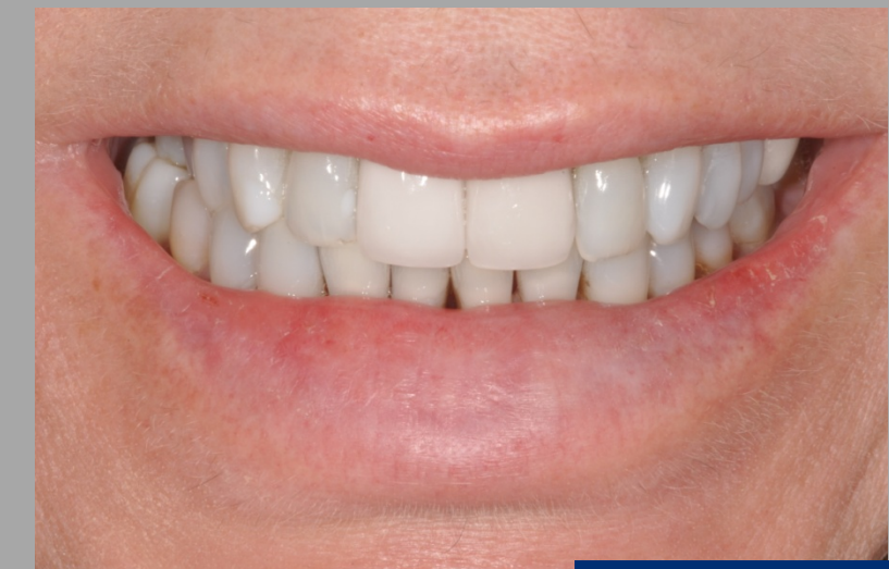
Final Implant Crown #8