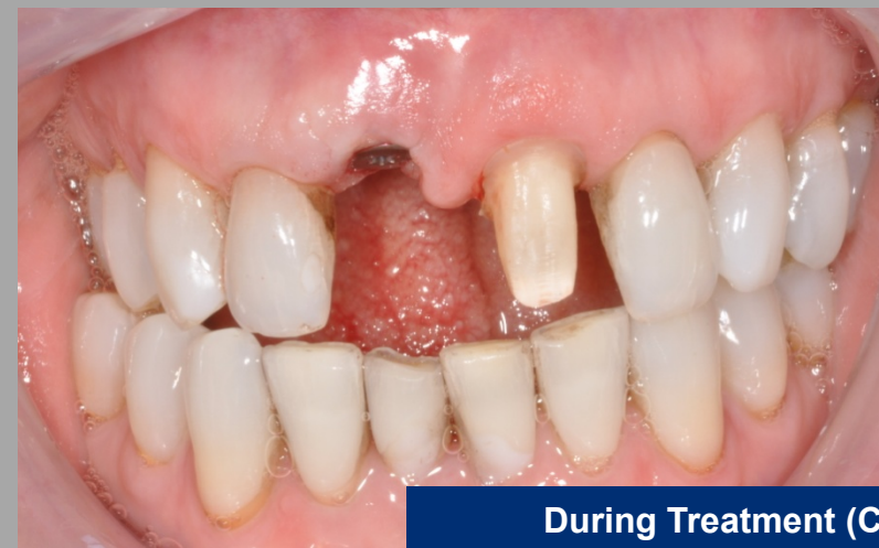
During Treatment (Cantilever Bridge #8-9)