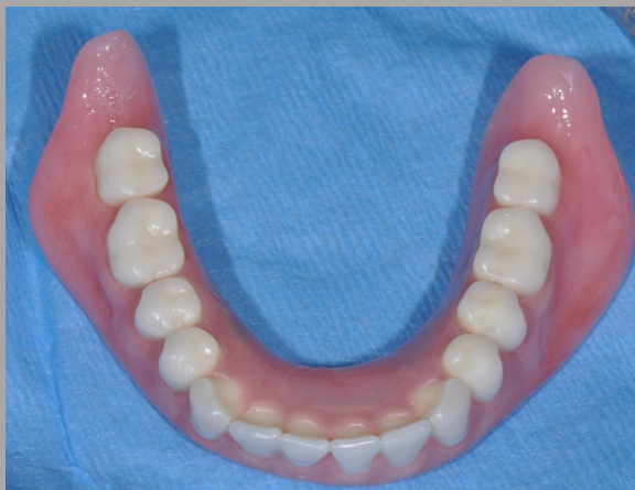
Implants without the Denture