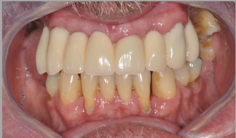
Temporary bridge on teeth used as transition, while implants are integrating