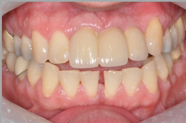
Final Implant Bridge #8-10

Testimonial: "I'm so happy to have my teeth back!" JK - Turnersville, NJ