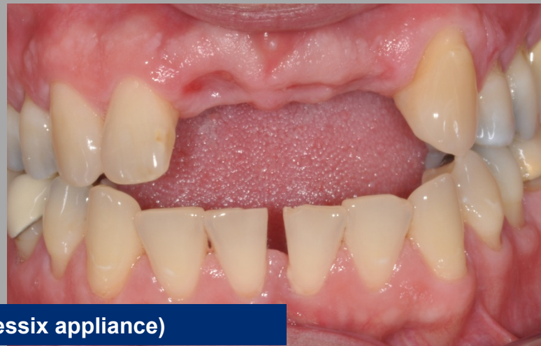
During Treatment (essix appliance)