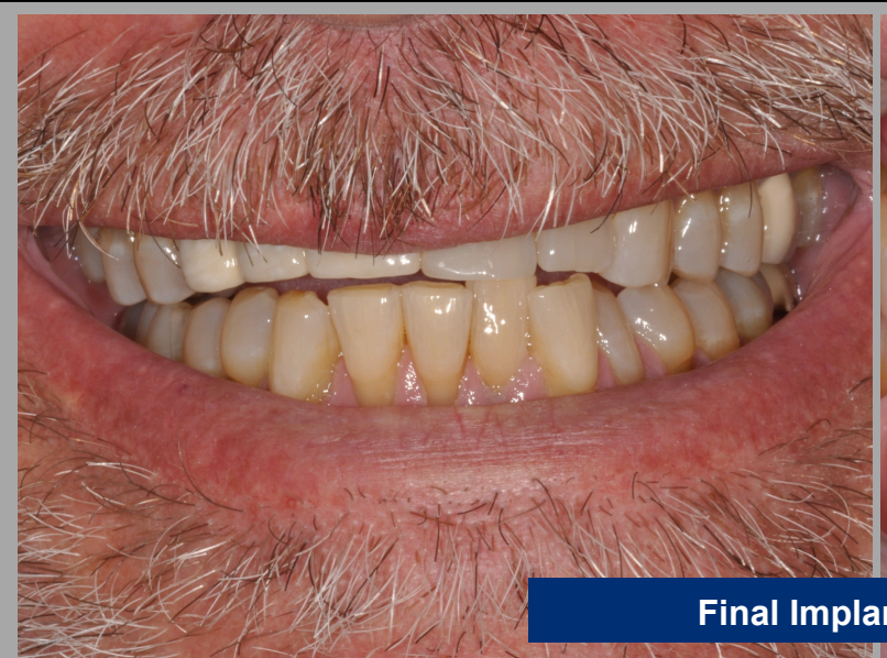
Final Implant Bridge #8-10