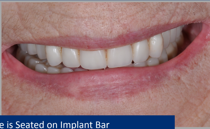
Implant Overdenture is Seated on Implant Bar

Testimonial: “It was a very long 6 months, but the end result was significantly worth every minute I had to wait. I was 35 when I had all of my teeth removed and have worn a denture for 30+ years. For the first day or two, I was apprehensive about biting into something, afraid it wasn’t going to work. Now they’re fantastic, it’s the only way to go.” NG - Sewell, NJ