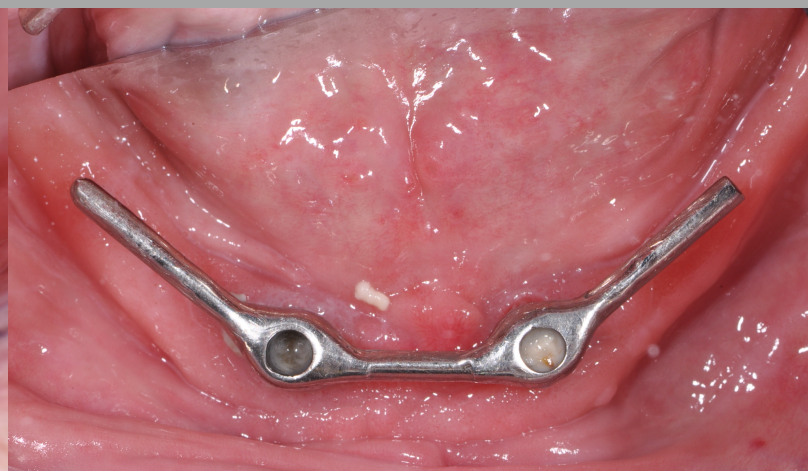
This bar is permanently connected to two implants