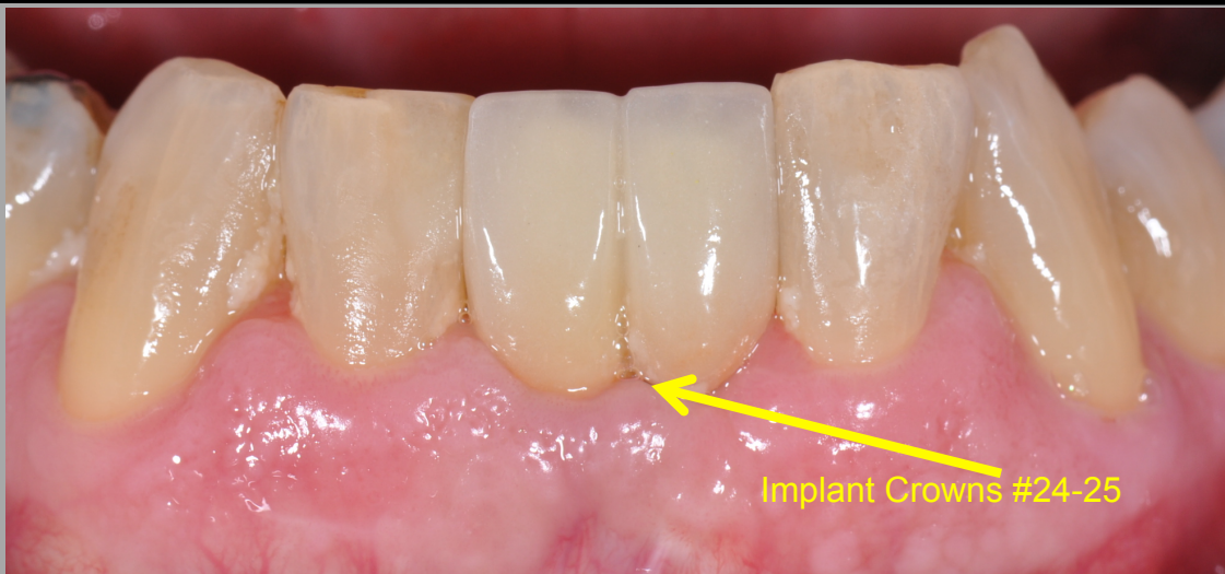
Final Implant Splinted Crowns #24-25

Testimonial: "I found that it was easy enough, just time consuming. I would do this again and it is what I expected; functional and esthetic" HG - Pitman, NJ