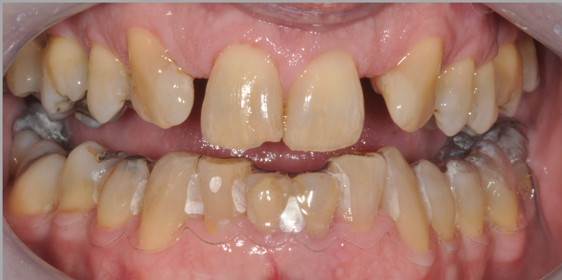
Patient is wearing an essix appliance during integration of implant #25